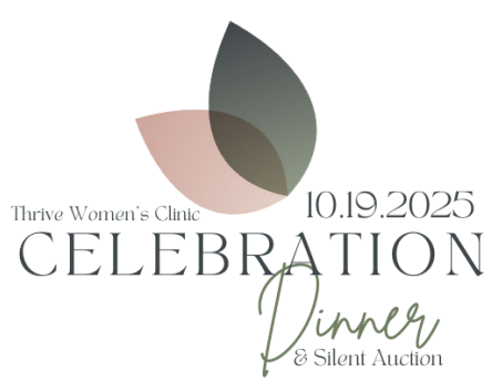
Table & Event Sponsorship Opportunities