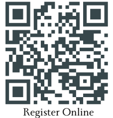
Table & Event Sponsorship Opportunities

Thursday, October 3, 2024 | Renaissance Dallas Addison Hotel